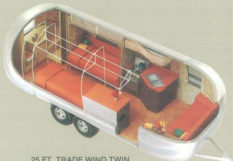
25 FT. TRADE WIND TWIN (Land Yacht) Hitch Wt. 725 lbs. Total Wt. 4090 lbs.