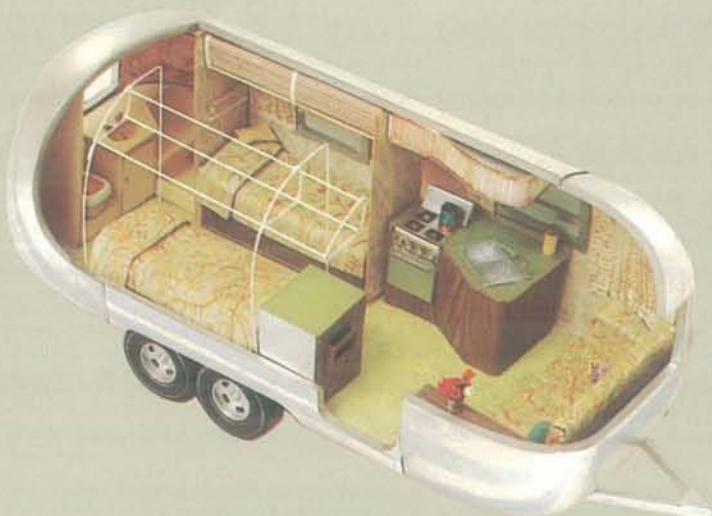
23 FT. SAFARI TWIN (Land Yacht) Hitch Wt. 750 lbs. Total Wt. 3800 lbs.